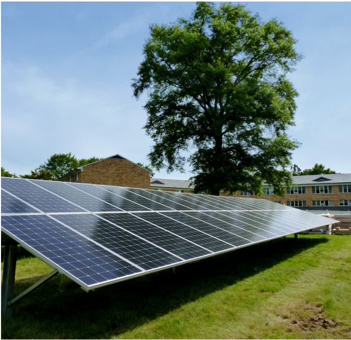
Ground Mount 122 kW